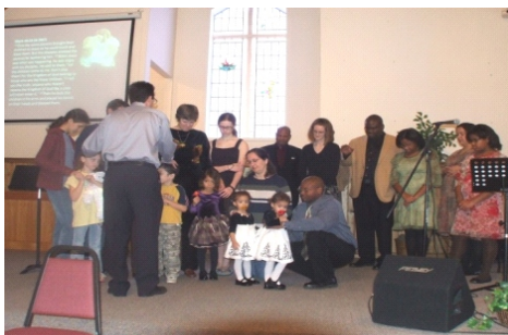
Last Sunday we Dedicated Six Children to God! Yea God!

We've restricted our giving to these objectives primarily because we believe (1) We must become a healthy church first-we have to reach our Jerusalem. (2) We believe we must support the District in our effort to become healthy again-we must reach out to Judea. (3) We must reproduce-give birth multiple times. (4) When we reach these commands of Jesus then, and only then will we reach the ends of the earth-going global.