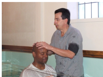
We also Baptized Five People! Yea God!