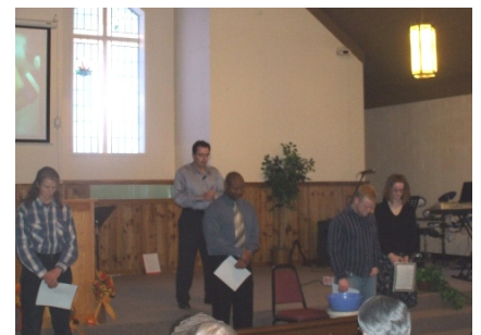
And We Received Five New Members! Yea God!

Excerpts from New Beginnings Fellowship's November 2007 Newsletter. Visit them on the Web at www.newbeginningsfellowship.cc